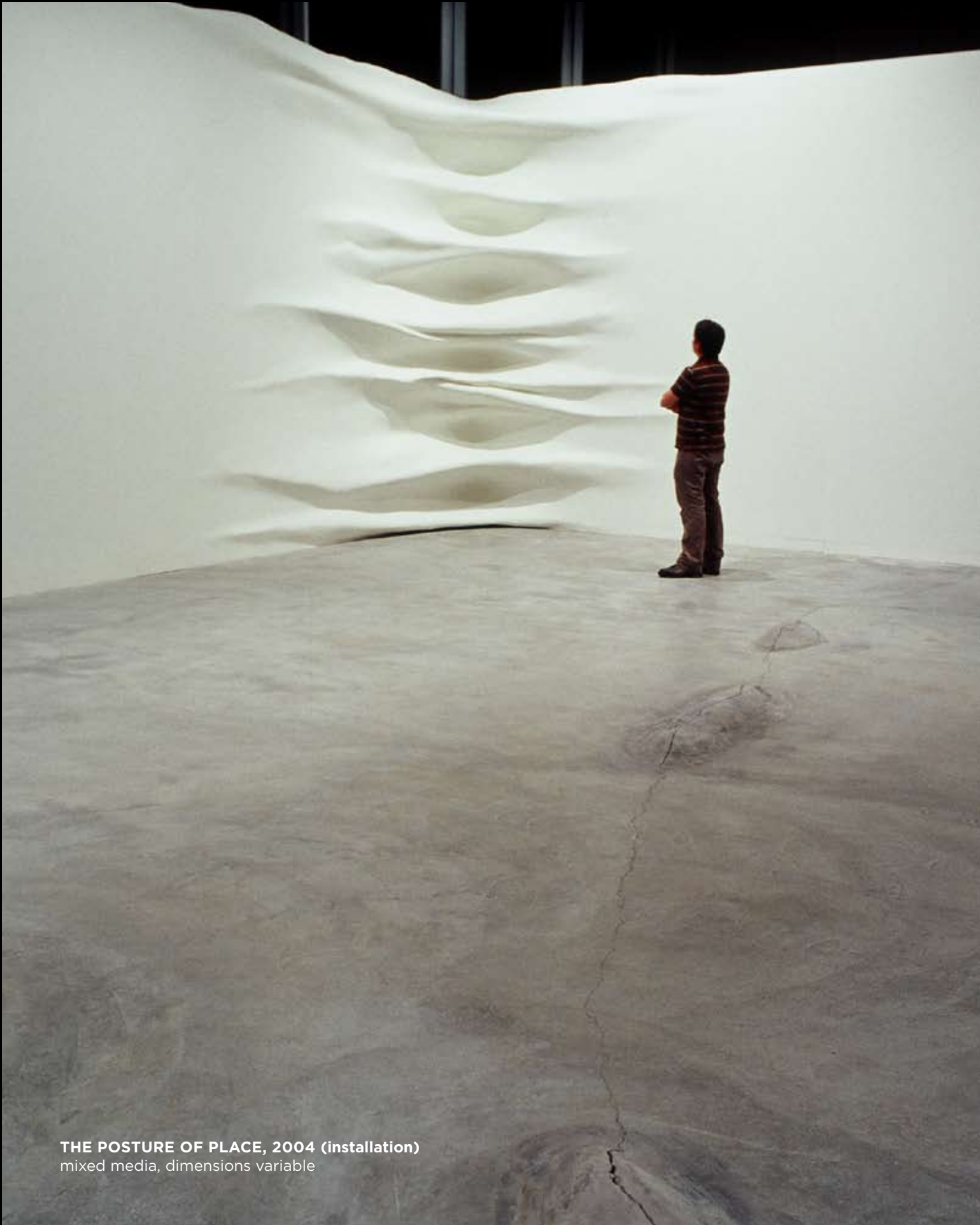
THE POSTURE OF PLACE, 2004 (installation) mixed media, dimensions variable