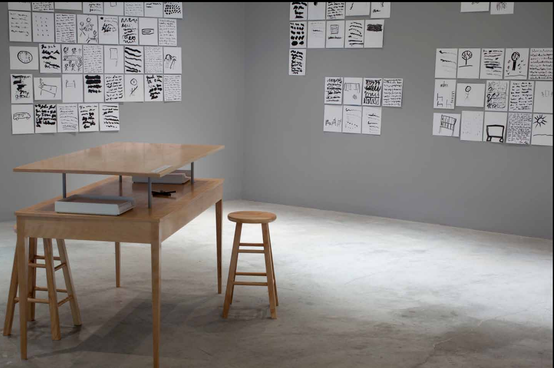
BETWEEN WORD AND IMAGE, 2012 (INSTALLATION) mixed media, sumi ink on paper, video, dimensions variable