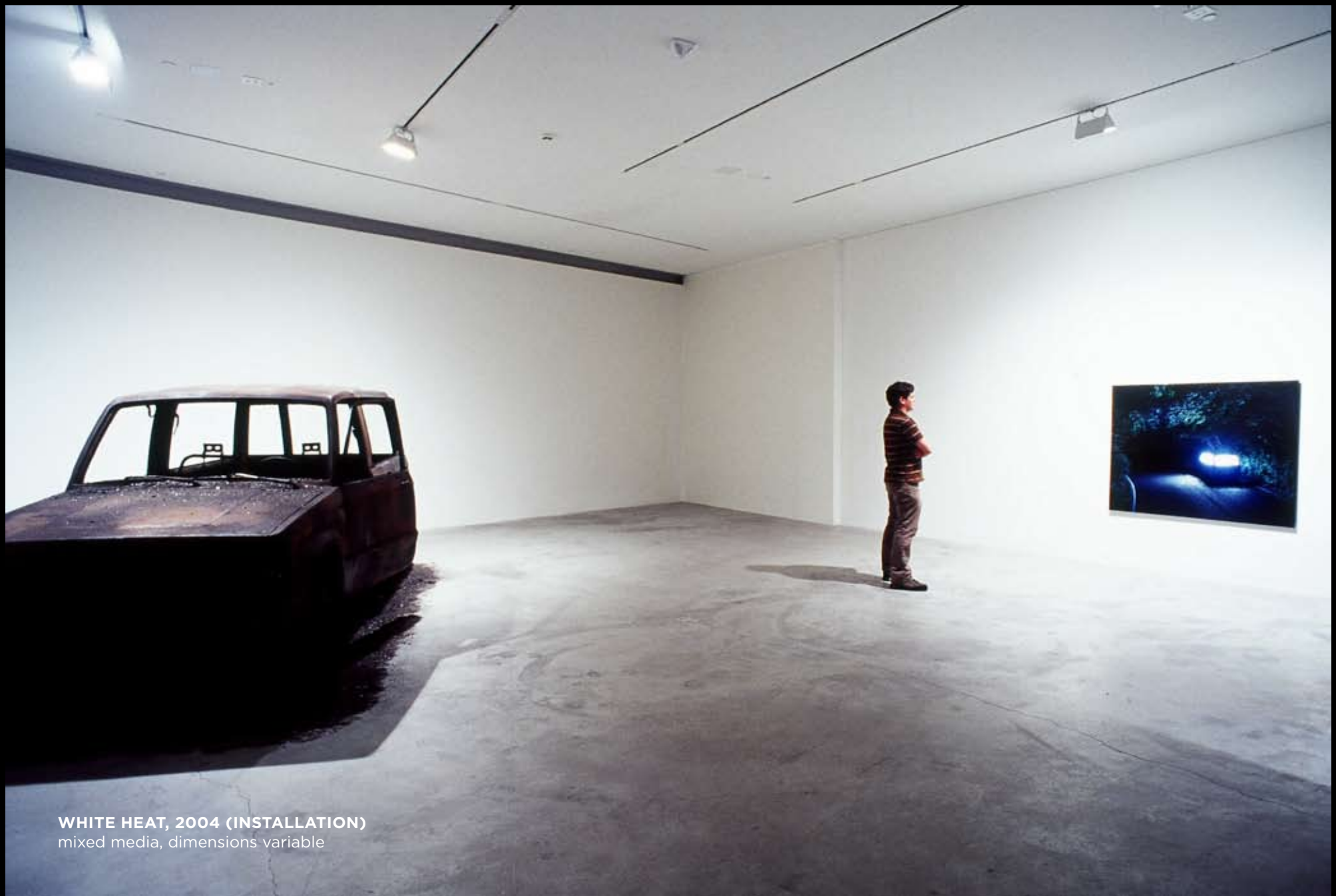
WHITE HEAT, 2004 (INSTALLATION) mixed media, dimensions variable